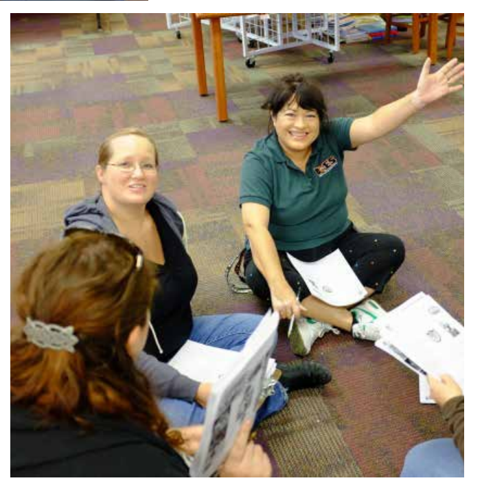
....the more arff you give yourself,...the more you can give the students.... ."YOU, the GREAT GiFT!"